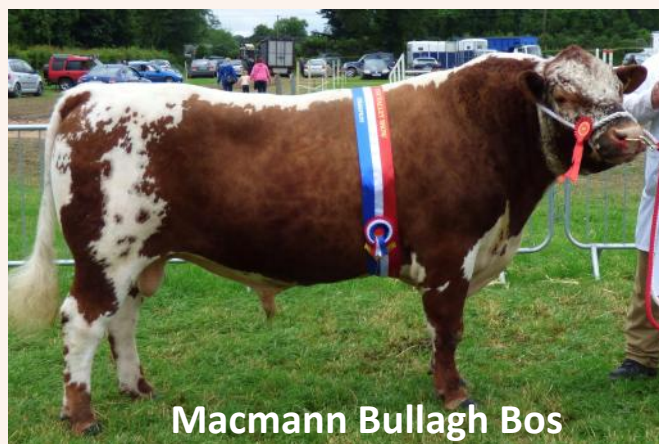
Macmann Bullagh Bos