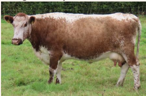
Daughter; 7 yr old